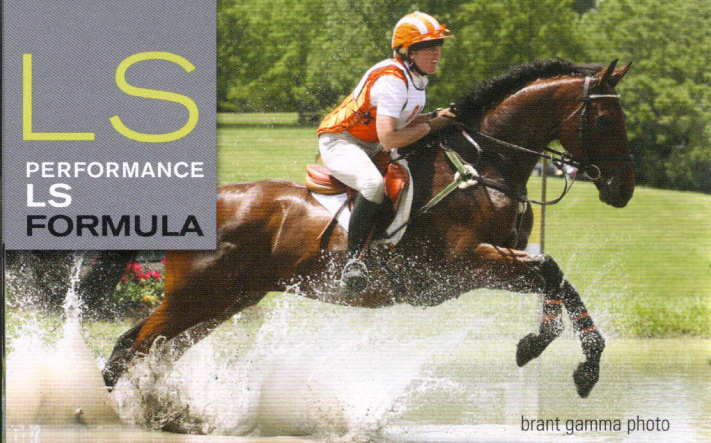
brant gamma photo

Sentinel® Performance LS , a Nutrient Release Formula feed, is the new generation in equine nutrition formulated specifically to enable equine athletes to meet their genetic potential and excel in the many aspects of performance. Exclusively formulated with high fat, high fiber and low starch/sugar ingredients, it is an ideal choice for equine athletes involved in a variety of competitive disciplines as well as horses with elevated caloric requirements such as hard keepers and rescue horses. This unique formulation of Sentinel® Performance LS is also recommended for certain horses with challenged digestive and/or metabolic systems. A pressure-cooked feed offers a safe and natural way to provide essential nutrition and extra calories to performance horses and is easily digested for optimal nutrient utilization.